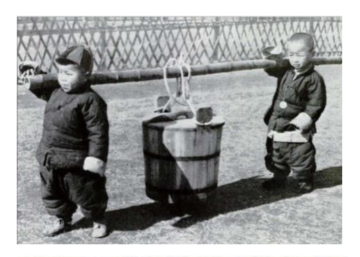
ABOVE: A camp rule: All must work. Youngsters also lend a willing shoulder. Tradesmen are given an opportunity to ply their skills.