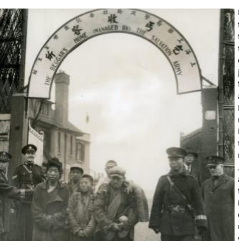
Main entrance of the Beggars Home which was jointly sponsored by the Shanghai Rotary Club and the Shanghai Municipal Council, and managed by The Salvation Army